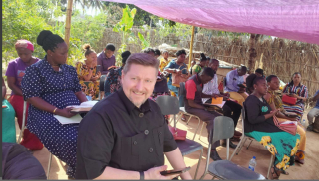
Radical Orators On The Long, Rough Road...

While it is good to see the potential for spreading the gospel in foreign lands, we must also see the need here in our own backyards!