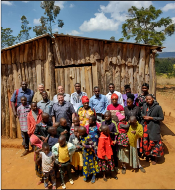
Radical Orators On The Long, Rough Road...