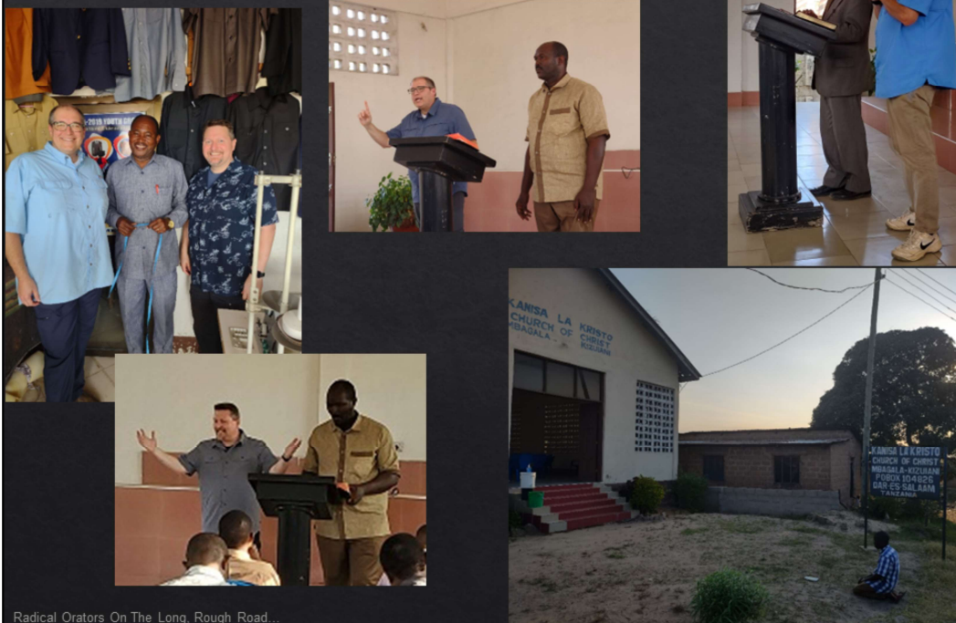
Radical Orators On The Long, Rough Road...